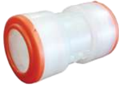
PUSHON STRAIGHT COUPLING