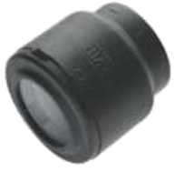
PUSHON END CAP