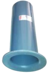
PVC BELL MOUTH - SP